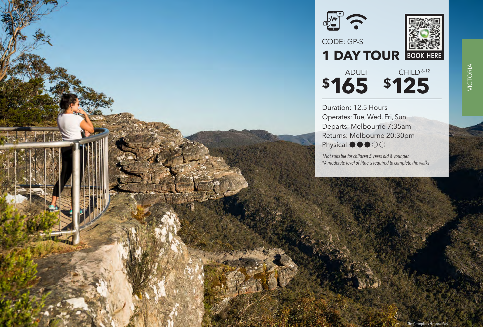
The Grampians National Park

*A moderate level of fitness required to complete the walks