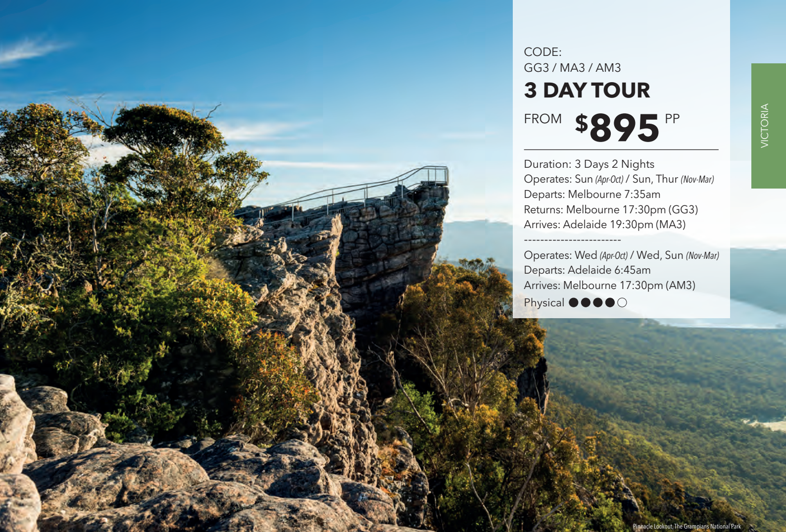
Pinnacle Lookout, The Grampians National Park