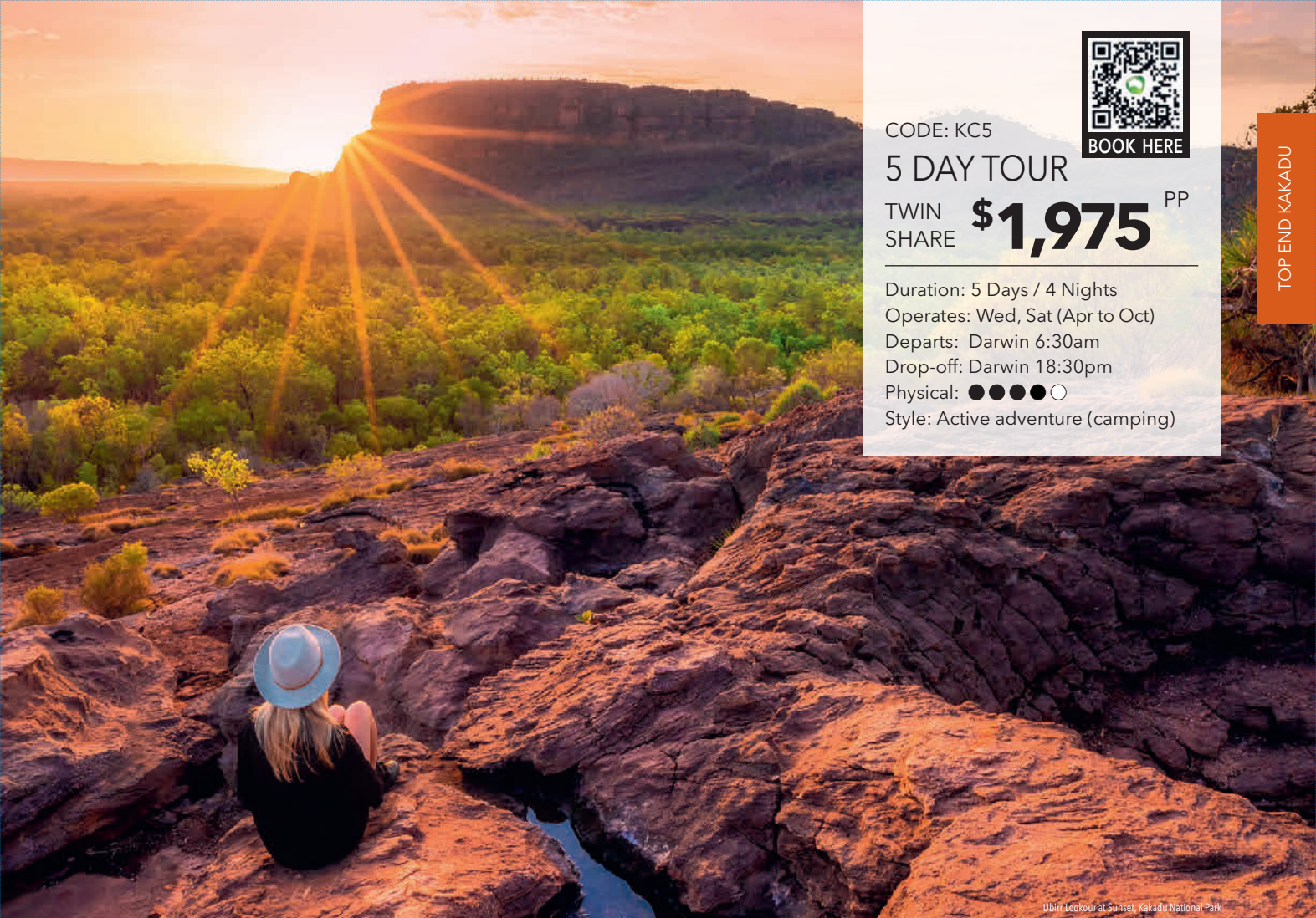
Ubirr Lookout at Sunset, Kakadu National Park