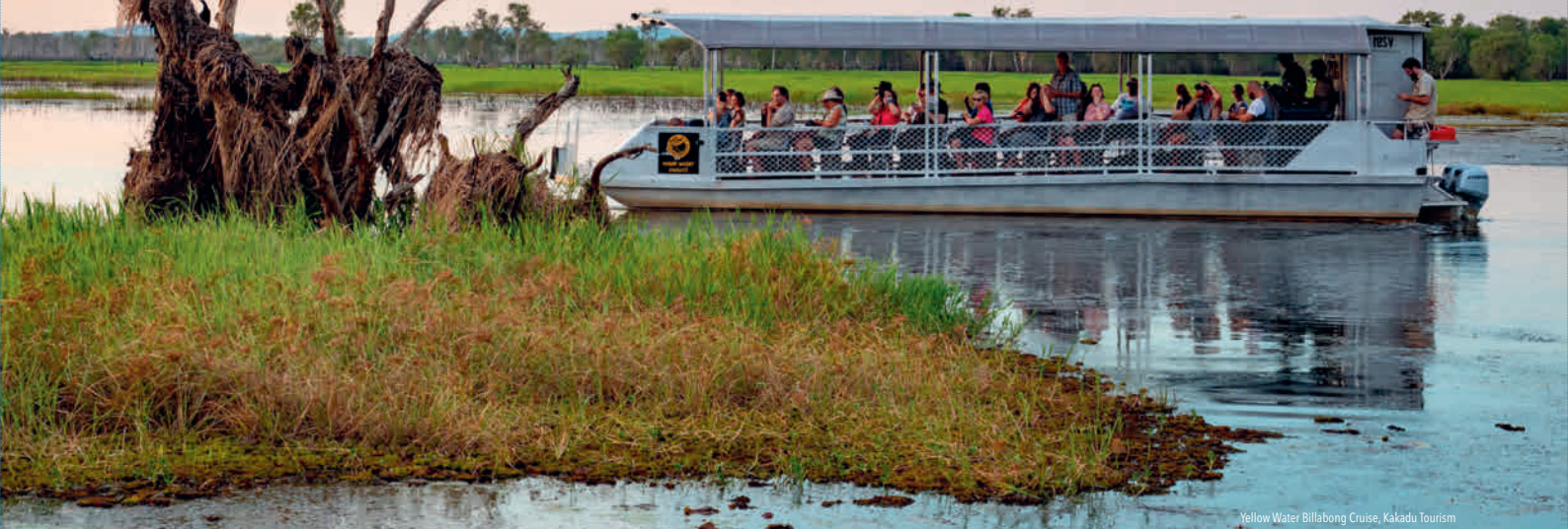
Yellow Water Billabong Cruise, Kakadu Tourism